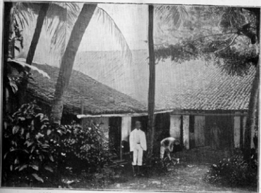
CORNER VIEW OF INNER QUADRANGLE, WESLEY COLLEGE